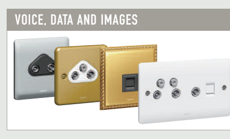
VOICE, DATA AND IMAGES